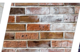
Efflorescence on Wall