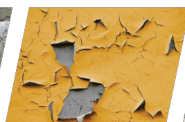
Flaking of Paint