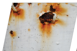
Corrosion of Steel