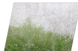
Growth of Algae & Fungus

Following are some examples of adverse effects of water