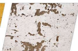
Crumbling of Plaster