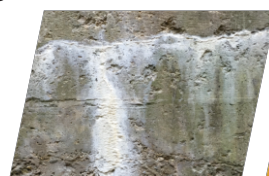
Leaching in Concrete