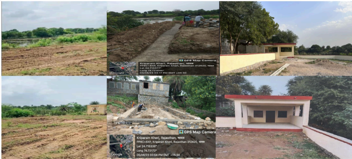
Before Construction Photo