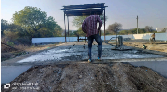
Payri samshan boundary wall and misc work