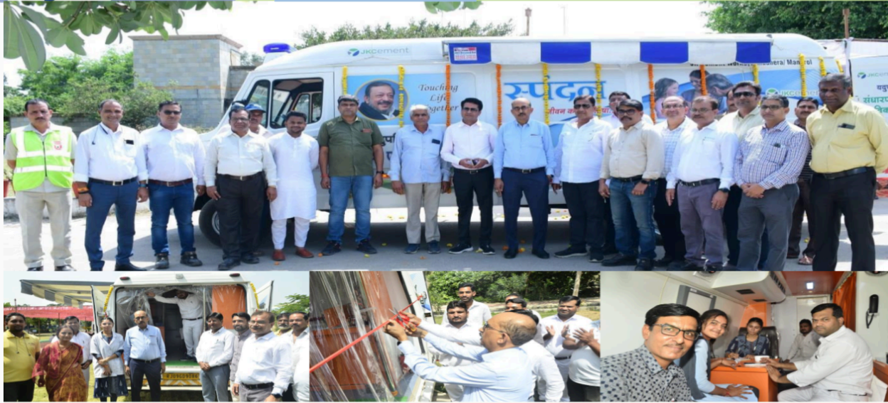
Inauguration of Mobile Medical Unit (MMU) at Fachar Ahran Village to facilitate near by communities. Around forty four adolescent girl's hemoglobin and iron checked by our team.