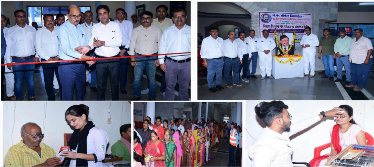
Inauguration of Eye Checkup & Screening Camp in Collaboration with Gomabai Eye Hospital at RTC