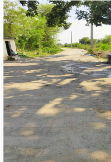
Constructed CC Road at Kripa ram Ji ki Dhandhi Arniya Joshi village.