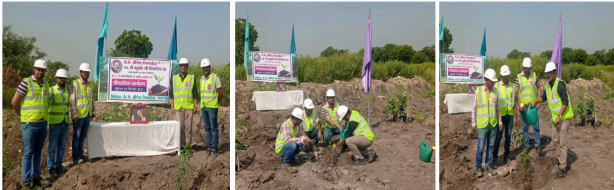
Plantation at Malyakhedi village