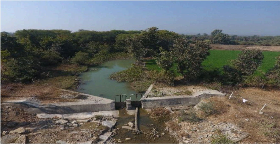
constructed an Anicut at Maliyakraera village