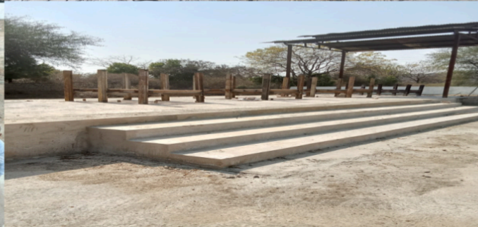
Pemdiya kheda samshan boundary wall