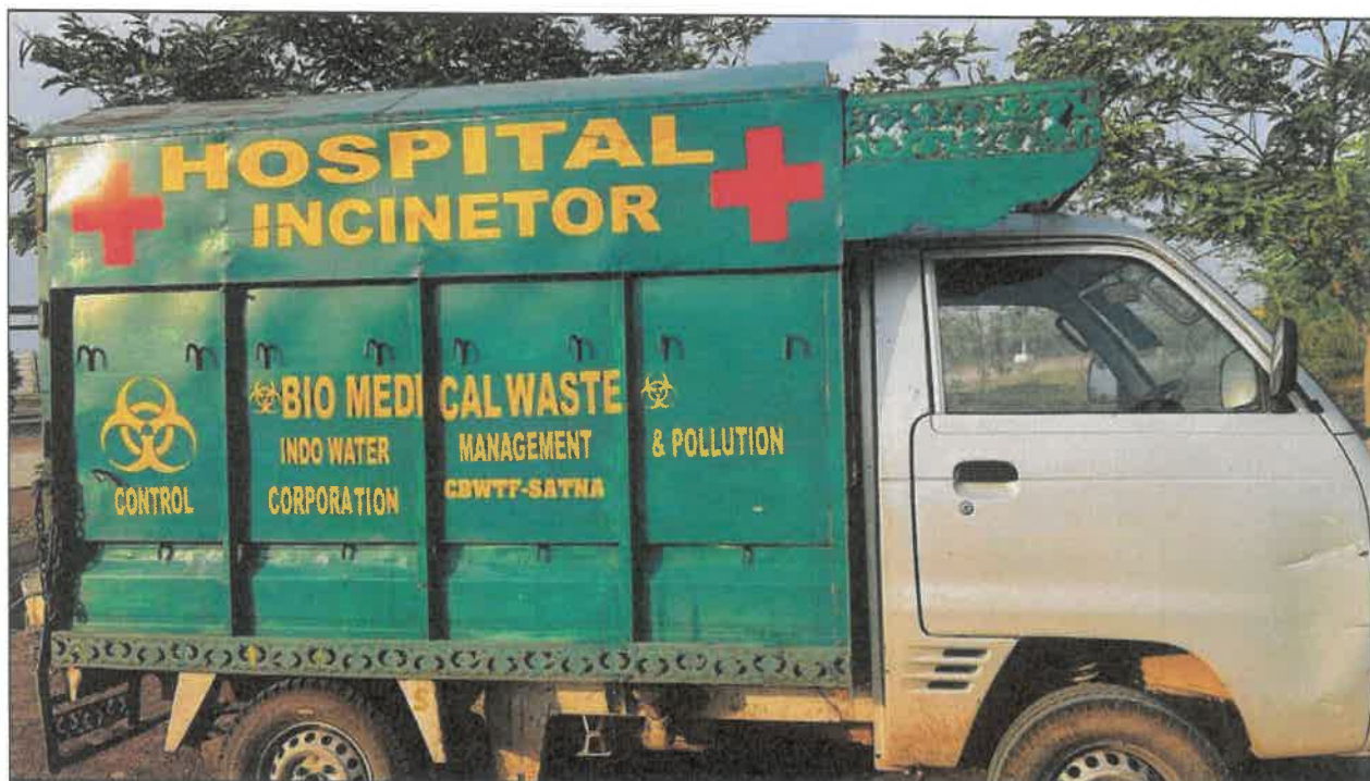
Bio Medical Waste collection Vehicle