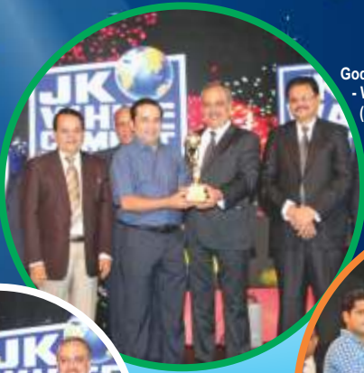
Goda Sales Corporation - Winner, White Cement (Rest of Maharashtra)