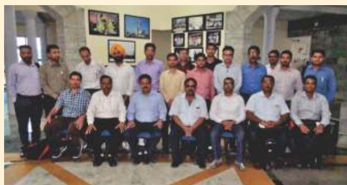
Grey Cement North Marketing Team