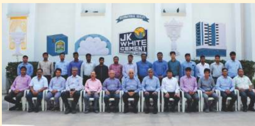
White Cement Marketing Team

The focus of all the three programmes was on sharing the glorious achievements of the Group, Company's philosophy, culture & values, manufacturing of cement, production and quality control etc.