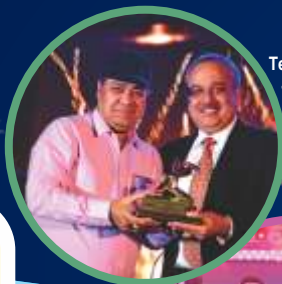
Tech Pro Marketing - Winner, Wall Putty (Madhya Pradesh)