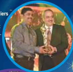
Friends Suppliers Co - Winner, White Cement (Rajasthan)