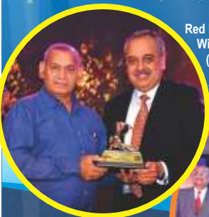
Red Rose Corporation - Winner, Wall Putty (Gujarat)

JK Cement Ltd. has always gone the extra mile instrengthening our association with the torchbearers of our success story, our channel partners. This grand gesture is also a part of a long standing tradition. It was a great achievement on the part of the Branding and Communication team as the dealers went back with very fond memories of what they called the best dealer's conference they had ever attended!