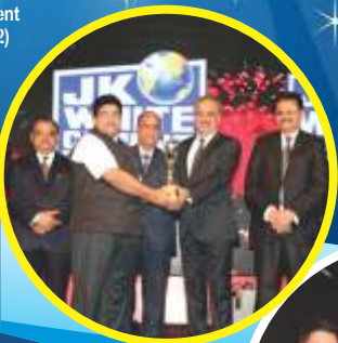
Chetak Minerals - Winner, White Cement & Wall Putty (Mumbai)