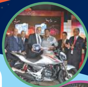
Balaji Enterprises - Winner, White Cement (Tamilnadu)