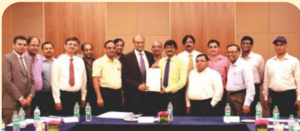
Exchange of documents between the Bank and the Company

Joint Lenders Meet of J.K. Cement Ltd was held on 29th July at Hotel Crowne Plaza, New Delhi to discuss and review the performance of the Company for the quarter and year ended on March, 2016, which was attended by Senior Executives from the banks and the Company.