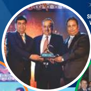
Shree Agencies - Winner, Wall Putty (Rajasthan)