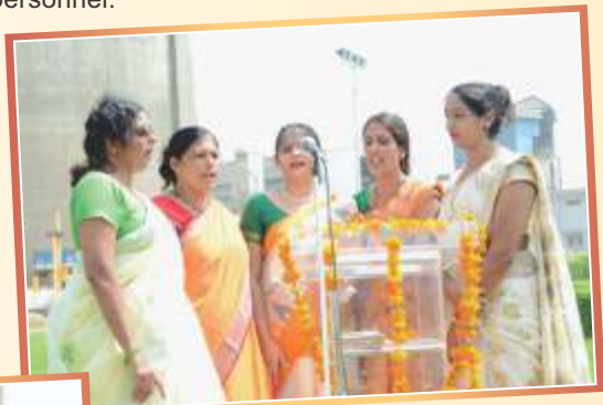
Pragati Club members performing on the occasion