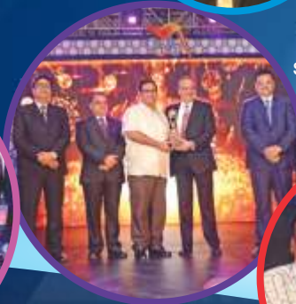
Shakti Marketing - Winner, White Cement (Gujarat)