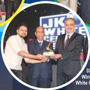
Deepa Marketing - Winner, Wall Putty & White Cement (Andhra Pradesh 1)