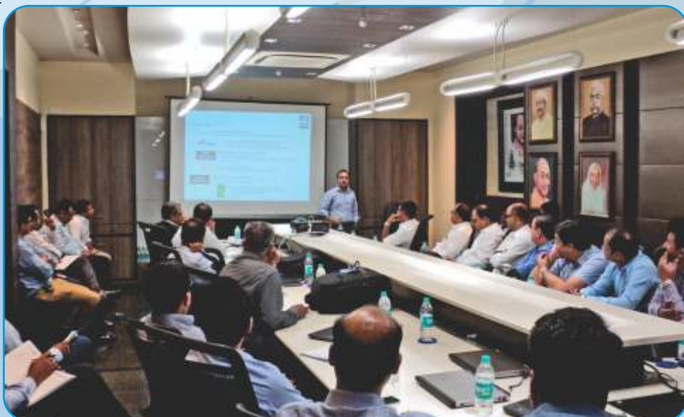
Leading practices session on Order to Cash by Accenture

Accenture conducted a session on leading practices in sales and marketing on 26th August. The session focused on trends in customer relationship management and impact of Digital Shift and how it is changing the business world. They gave insights into the benefits of implementing CRM and using CRM as a tool for decision making.