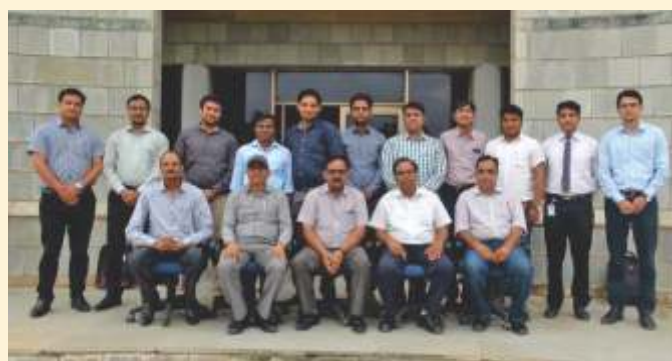
Grey Cement North Marketing Team