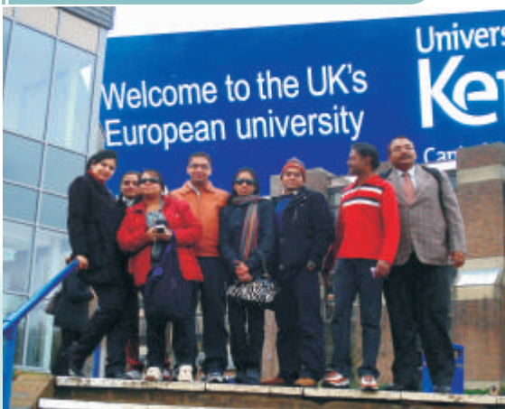
Students in the Campus of Jent Business School, University of Kent, Conterbury