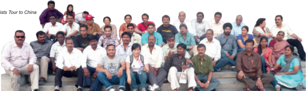
Stockists Tour to China

Everyone thoroughly enjoyed visiting the Great Wall of China in Beijing and marvelled at one of the great wonders of the world. Another highlight of the trip was the Huangpu River Cruise ride. It turned out to be a memorable expedition for all.