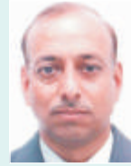
RK Bajaj A.V.P. (Projects)