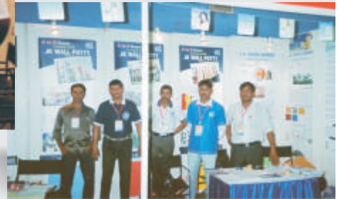
Exhibition Bace Expo 2010 organised by Indian Institute of Architects at Science City Grounds, Kolkata from 19th November to 21st November 2010