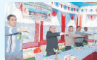
Dignitaries taking oath for Environment & Mineral Conservation