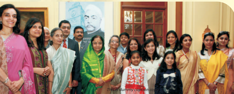
This is dummy caption co