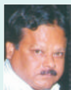
USP Karna Chief Burner