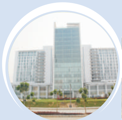
Vedanta Hospital (Medicity Project), Gurgaon