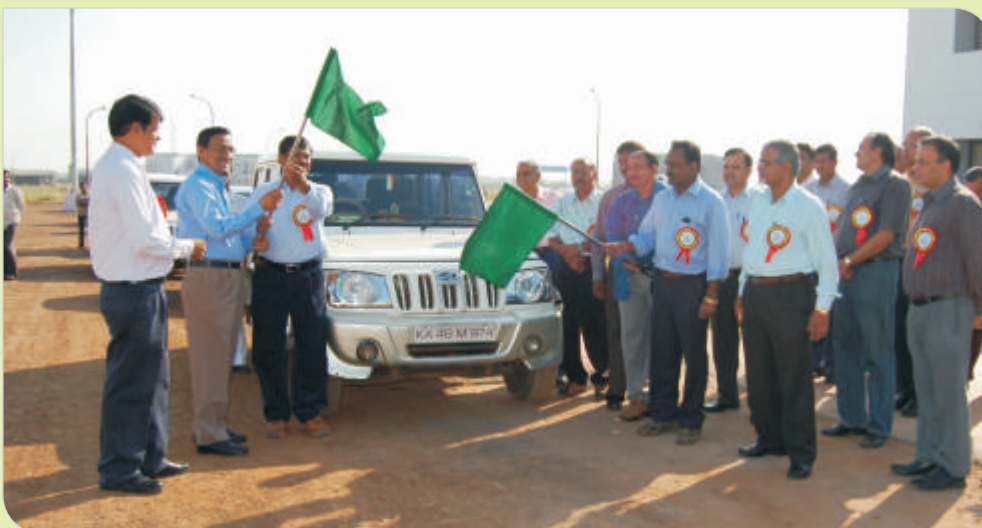
J.K. Cement Works, Muddapur witnessed a ceremonial flag off ceremony for Mines' Safety Week 2010 of Mines Safety Association Karnataka Zone-IV at Padam Nagar Guest House premises