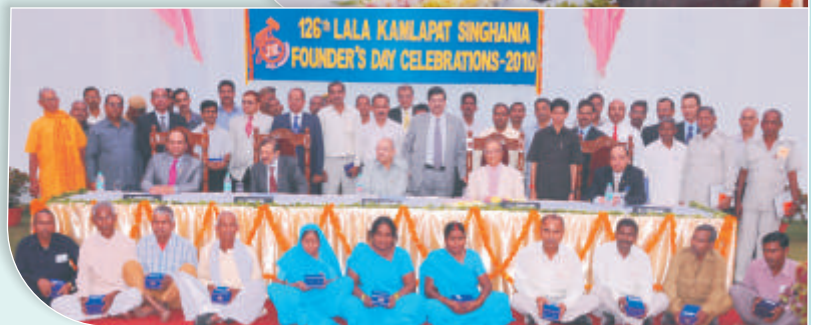
Recipients of the Award for long & dedicated service towards J.K. Organisation