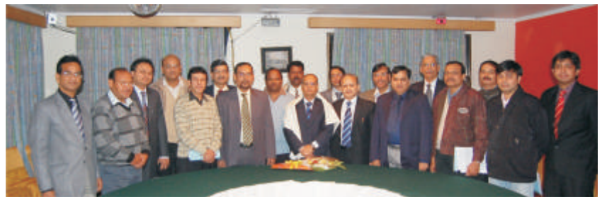
Bankers' Meet at Nainital