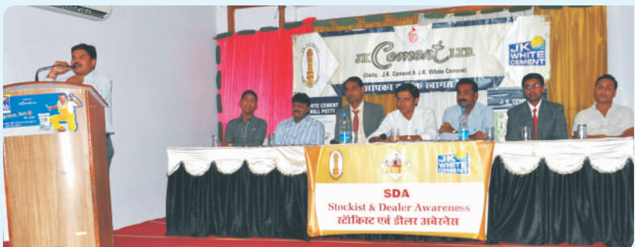
Company Officers at the Stockists and Dealer Awareness Programme conducted on 26th November, 2010 at Jabalpur