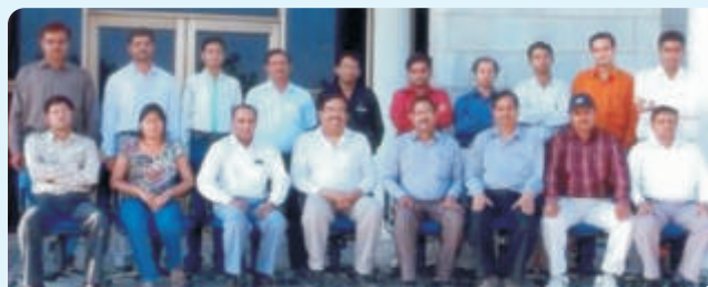
Training Programme - Thermal

A workshop on Operation and Maintenance of Crushers, Stackers and Reclaimers and Maintenance of Electrical Equipment, Transformers and Switchgear was conducted for technicians.