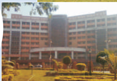
Accounts General Office, Chattisgarh