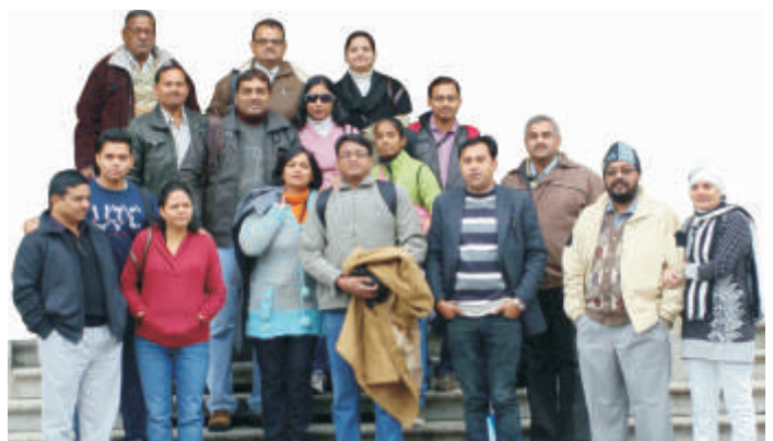
Company Officers & Stockists along with their families in Europe

A trip to Europe was organised from 25th to 30th November, 2010 by J.K. White Cement on the basis of points scheme. Eighteen people including company officers and stockists along with their families were a part of this unforgettable tour. The team explored everything from charming Zurich to romantic Paris and everything in between. Chilly glaciers, chugging train rides in the rolling Alps, the magnificent Eiffel Tower with a scenic river cruise at the Seine, the group certainly had everlasting memories to take home.