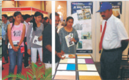
Visitors at the J.K. Cement Stall set up during the Inside Outside Mega Show Exhibition organized at Chennai from 2nd - 5th September, 2010