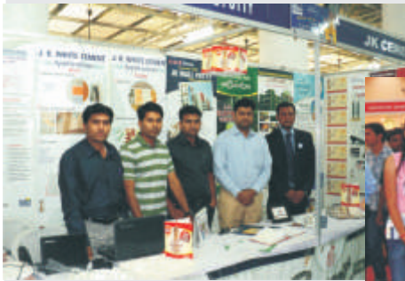
Company Executives at the "Lokmat Good Home Show" an Exhibition organized by Lokmat Newspaper at Aurangabad from November 28th to 31st November, 2010