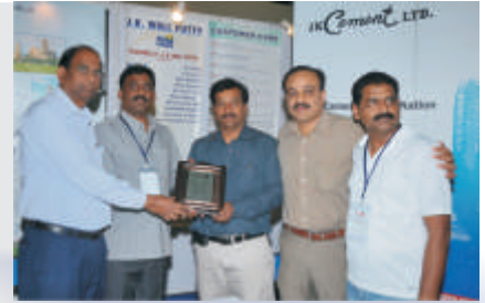
APREDA Property Exhibition Show organized at Hyderabad on 30th October-31st October, 2010