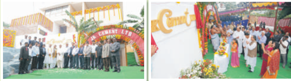
J.K. Cement Team at Tirupati Guest House

J.K. Cement Ltd. donated a Guest House in Tirumala Hills at 6, Balaji Nagar, Tirumala, Tirupati to the Tirumala Tirupati Devasthanams Trust. There are 12 rooms in this guest house which will be handed over to TTD, Tirupati in the month of January, 2011.