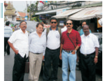
Company Officials & Stockists in Bangkok

Besides the limitless possibilities for shopping in the gigantic malls of Bangkok city, the group also soaked in the sun at Pattaya beach while sampling some of the exotic Thai delicacies.