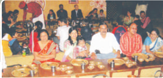
Deepawali Milan Samaroh-Indore